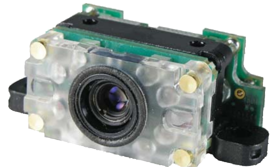
Optical Subassembly and Licensed Decoder

These full omni-directional readers are available in configurations to meet your integration needs. Several focal distances, mounting options, aiming ergonomics, and decoder license configurations are available. These options help integrators incorporate the benefits of image capture into a wide variety of devices including bar code scanners, handheld mobile computers, medical instrumentation, diagnostic equipment, gaming terminals, vending machines, and robotics.